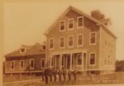
Hospital and corps. (No. 37)