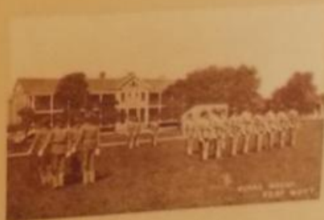
Parade Ground with Company Barracks in background. (No. 34)