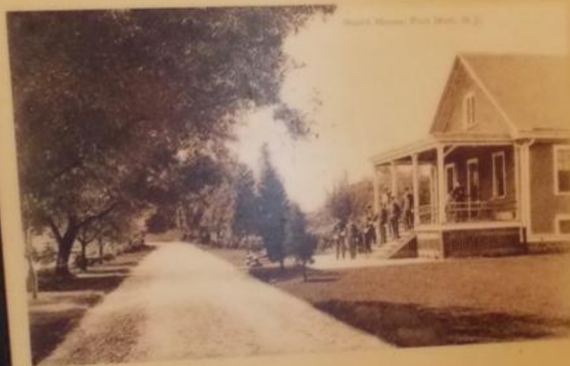
Guard House: Currently houses the Fort Mott State Park Office (No. 27)

As the fortification expanded in size, numerous structures were built or modified, and others were removed from the reservation.